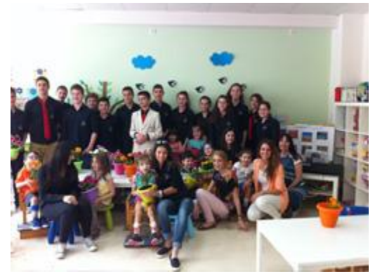
Celebration of Mother's day New Generation – Ziridis School at ELEPAP.