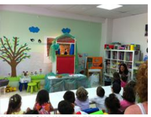
PUPPET SHOW at ELEPAP